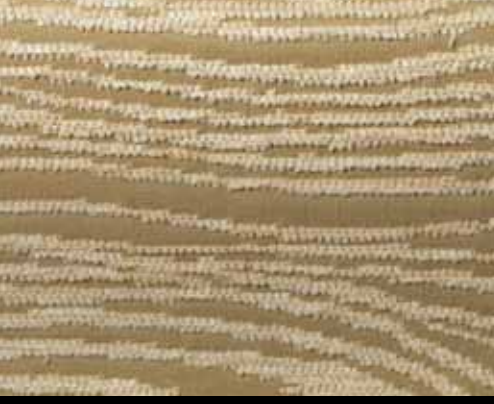
987-229 what knot_sahara