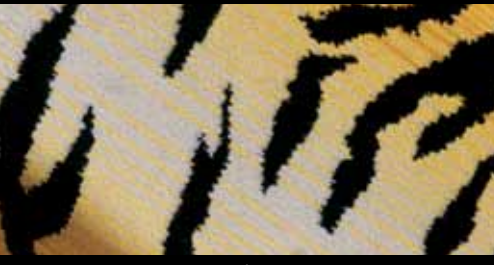
996-255 city kitty_topaz