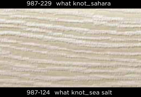
987-124 what knot_sea salt