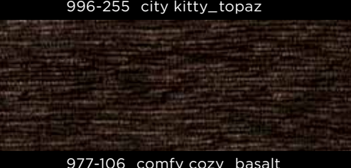
977-106 comfy cozy_basalt