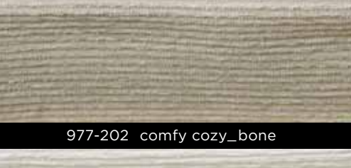
977-202 comfy cozy_bone