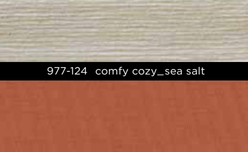
977-124 comfy cozy_sea salt