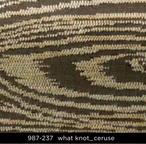
987-237 what knot_ceruse