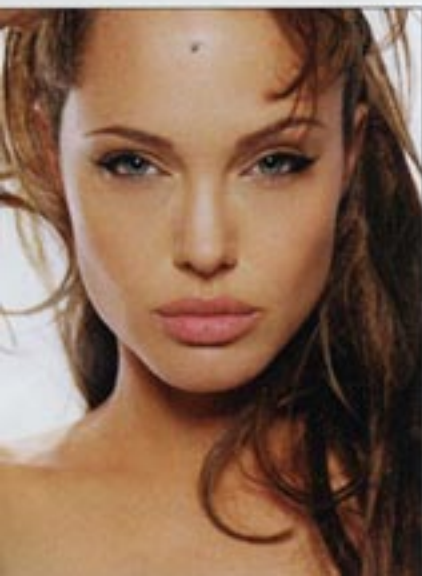
ON THE COVER: Angelina Jolie. See "Heart and Soul," page 52.

Home appointments that brim with earthy allure — from bold green accessories to coffee tables in rustic wood — bring the outdoors in