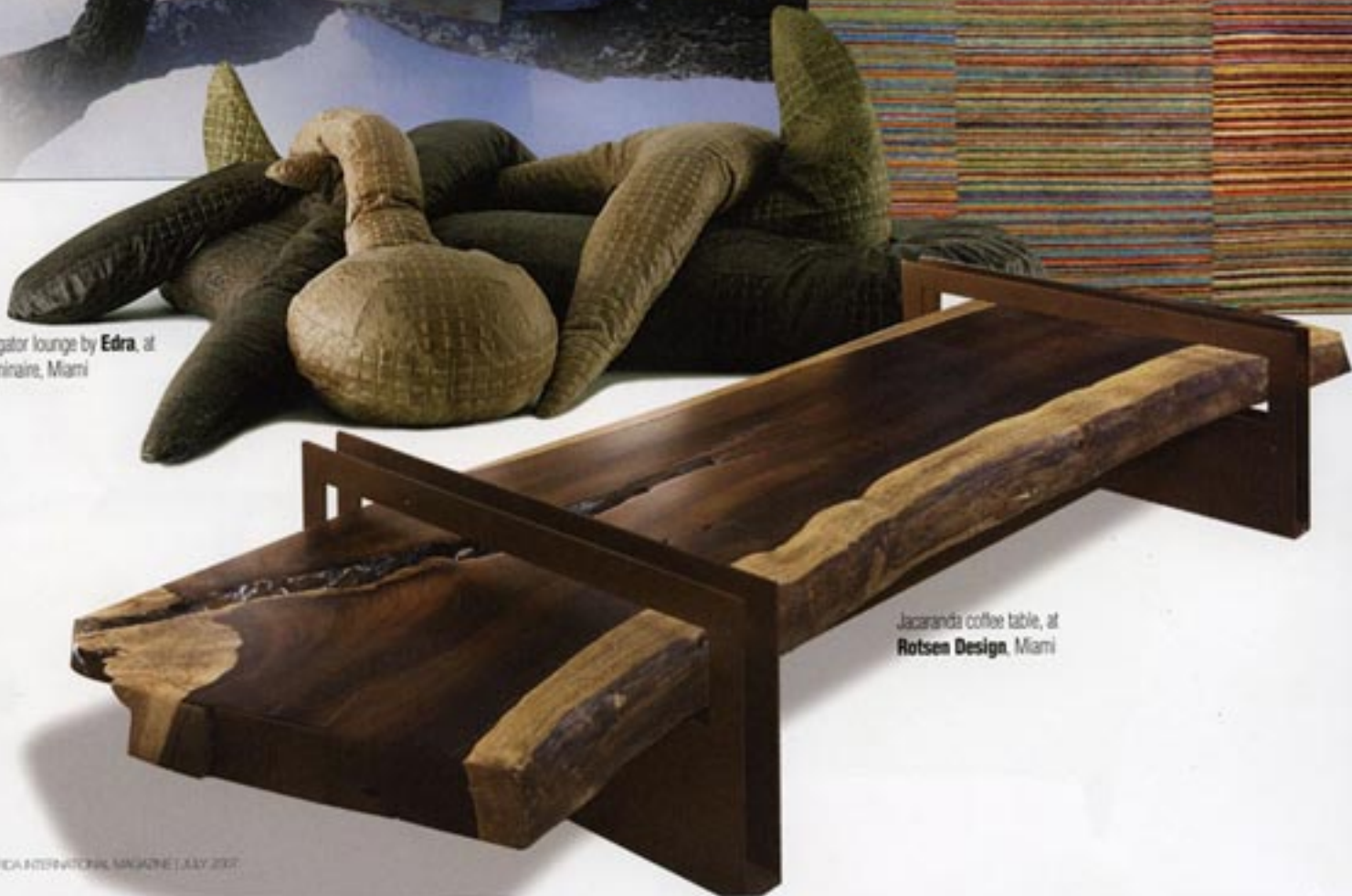
Jacaranda coffee table, at Rotsen Design , Miami