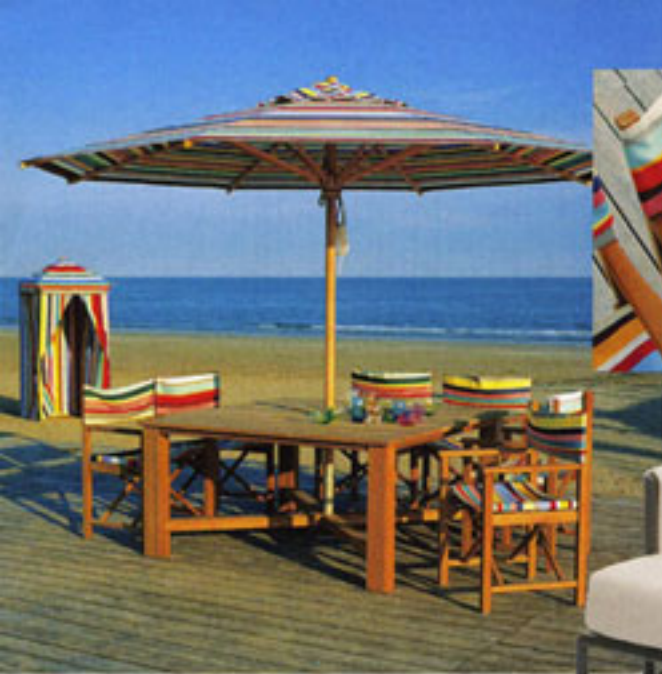
Jardin Mini-Stripe outdoor fabric. JANUS et Cie, San Francisco Design Center, 415.551.7800.