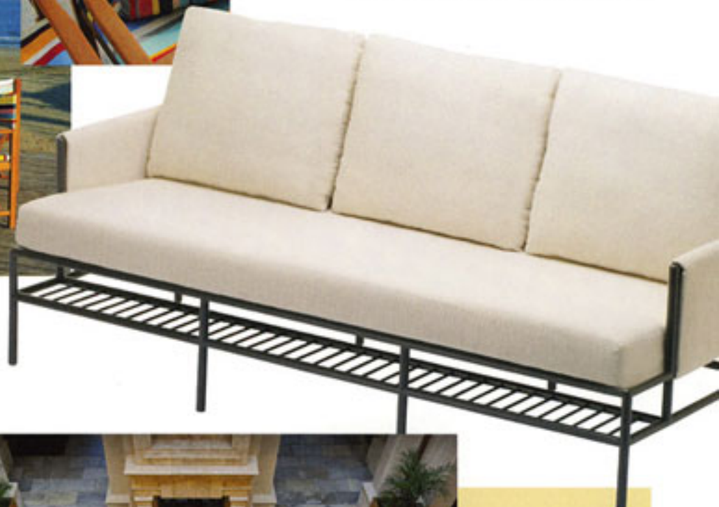
The Sherwood Daybed from the RobinWood Deluxe collection for Sutherland by Starck. Shears & Window, San Francisco Design Center, 415.621.0911.