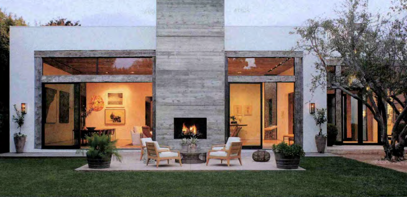
On the rear terrace, Summit Furniture armchairs are upholstered in a Perennials outdoor fabric. Below: Landscape architect Pamela Burton conceived the grounds.