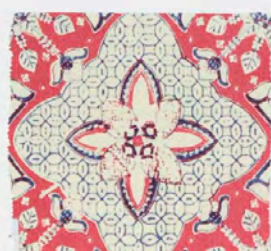
New Batik in Magenta, China Seas, Quadrille, price available to the trade; quadrillefabrics.com