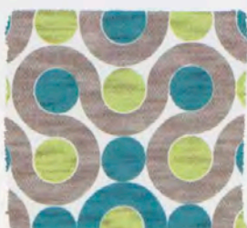
Solaris in colorway 674, Zimmer + Rohde, $139 per yard; zimmer-rohde.com