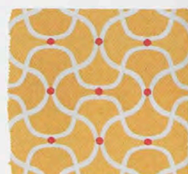
15510-539 in Banana, Duralee Pavilion V, Duralee, $103.50 per yard; duralee.com