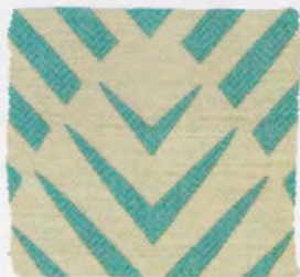
Palmwood in Turquoise, Robert Allen with Dwell Studio, $72.95 per yard (to the trade); robertallendesign.com

Vintage Stripe in Mandarin, Perennials Outdoor Fabrics, price available upon request; perennialsfabrics.com . Santorini in Tropical Green, Donghia, price available to the trade; donghia.com . Dockside Navy in Railroaded, Summer Classics, $48 per yard; summerclassics.com . Velluto #5400-17 in Mariposa, Chella Textiles, $176 per yard; chellatextiles.com . Tangier Frame Print in Cerise, Trina Turk | Indoor-Outdoor 2, Schumacher, price available upon request; fschumacher.com . County Fair in Robin's Egg, Perennials Outdoor Fabrics, price available upon request; perennialsfabrics.com . El Greco in Calypso, Sunbrella Fabrics, $56.99 per yard; sunbrella.com . Kimball in Peacock, Pindler & Pindler, $54.60 per yard (to the trade); pindler.com . Pinata in Amarillo, Donghia, price available to the trade; donghia.com . Soleil L.A. Print in Sunset, Trina Turk | Indoor-Outdoor 2, Schumacher, price available upon request; fschumacher.com . #31943-13, Oceania Cruises Collection for Kravet, price available upon request; kravet.com . Regatta in 002 Parasol, Maharam, $54 per yard; maharam.com .