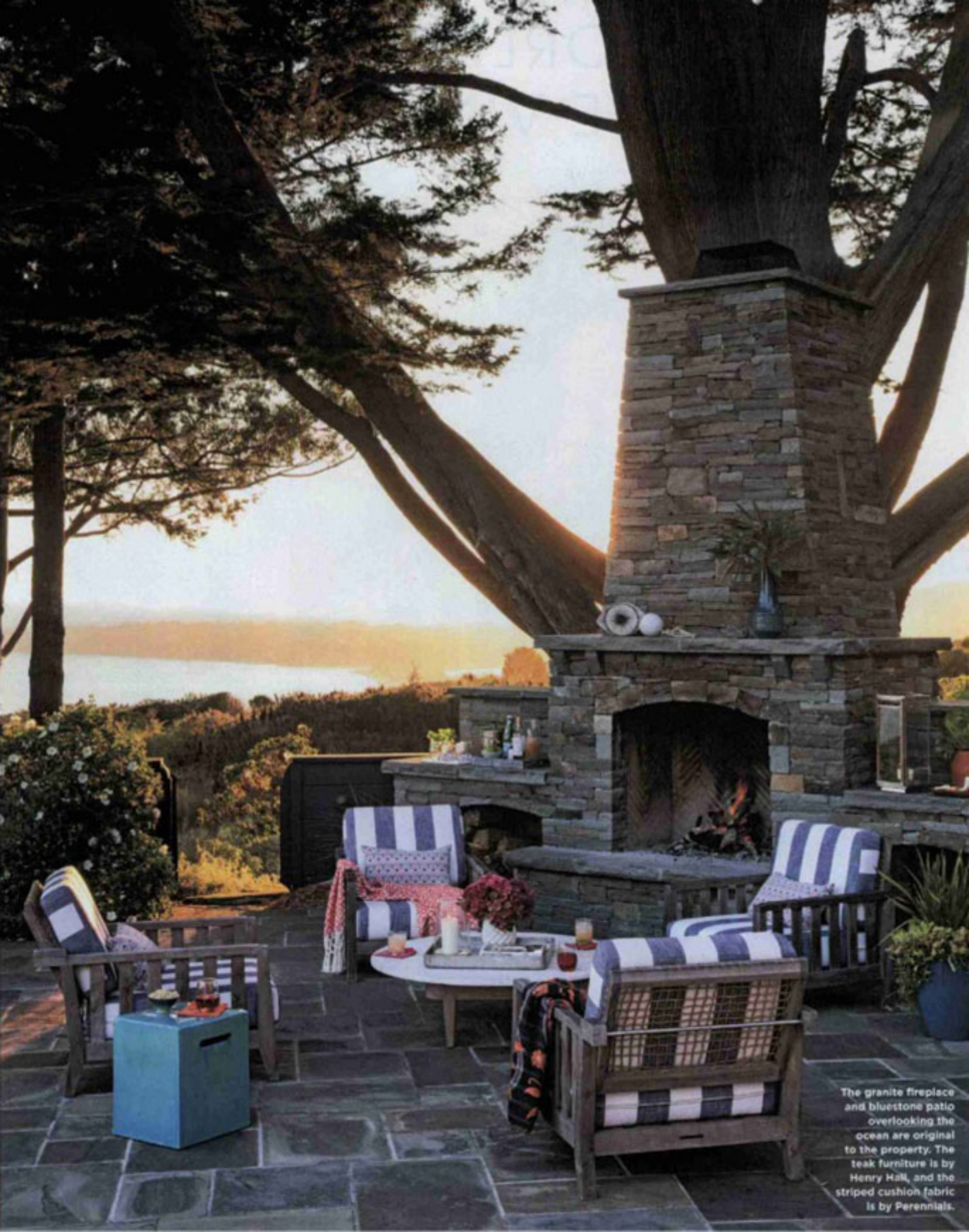
The granite fireplace and bluestone patio overlooking the ocean are original to the property. The teak furniture is by Henry Hall, and the striped cushion fabric is by Perennials.