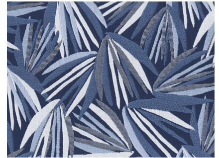
Palmetto fabric in Lapis