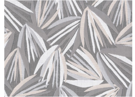
PALMETTO / LAPIS